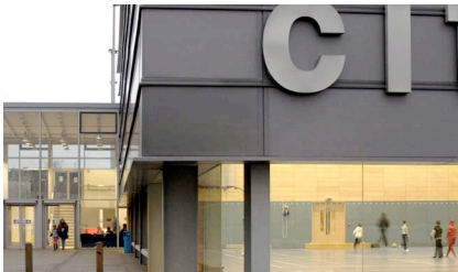
City Academy Bristol - Sports Hall Feilden Clegg Bradley Studios